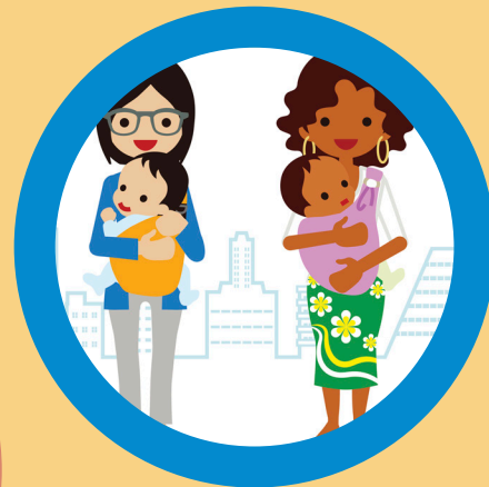
Peer-Support With WIC Program