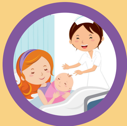
Baby-Friendly Hospital Initiative