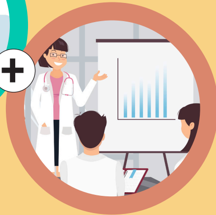
Health Care Staff Education