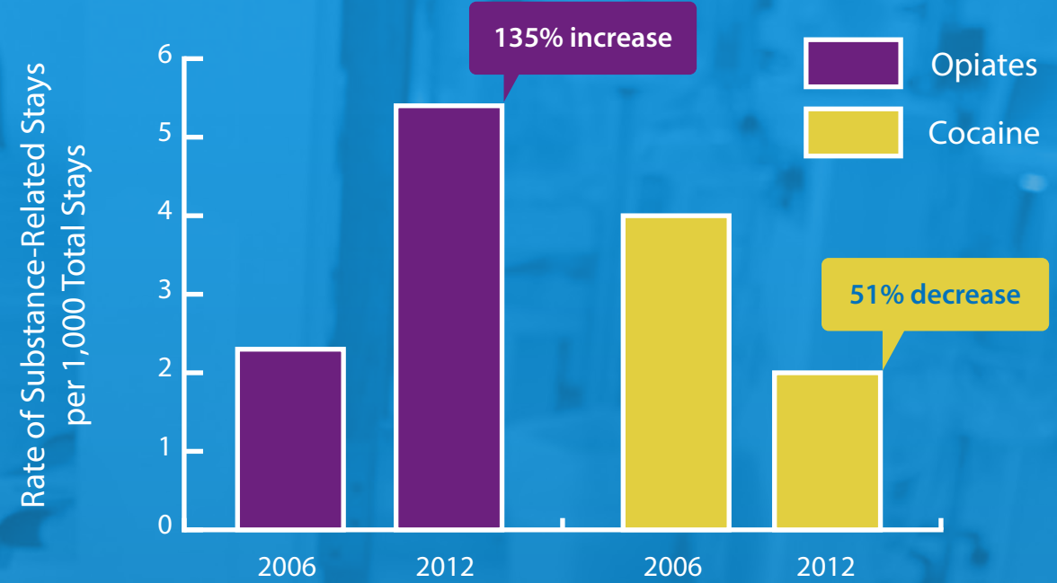
Newborns Exposed to Drugs Have Higher Complication Rates