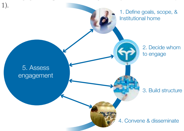
Figure1. Steps for Engaging Stakeholders in QI Initiatives for Child Health Care

We found that States had to make many major decisions when designing a stakeholder engagement process. These generally involved five major steps (Figure 1).